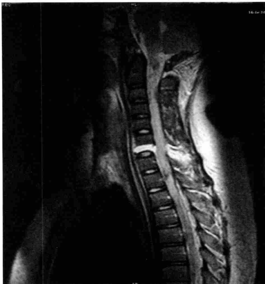
FIG. 4. MRI showing no evidence at all of any type of supratentorial lesion. There is disruption of the C6-C7 disc and an associated disruption in the posterior elements at the same level. The defect in the neuraxis, seen in the lower part of the brainstem, was evident throughout the cervical cord, extending down to the level of T1-T2.

states in humans will provide observations which allow for comparisons with experimental studies in animals. From the experimental studies in cats by Andersen and Andersson (1968), and others before them, it appears that the cortex contains neural networks that can generate spontaneous rhythms. Other observations have suggested that extracortical pacemakers normally drive the cortical activities. Bremer (1935) showed experimentally that the location of the EEG pacemaker lies