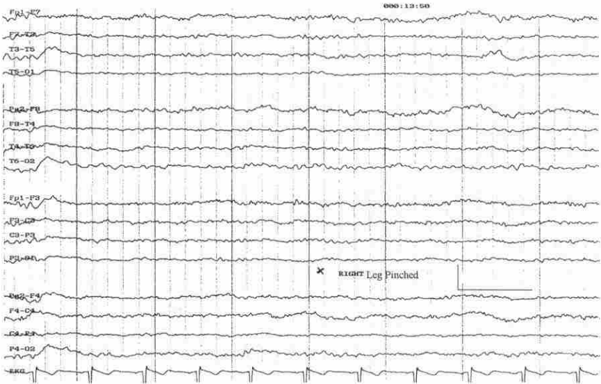
FIG. 1. The EEG revealed 9–10 Hz activity maximal posterior, with some diffuse non-specific slowing. Reactive to noise, not to tactile stimulation. The patient was very sleepy.

The patient was taught to communicate with eye movements, blinking once for “yes” and twice for a “no.” He was kept intellectually stimulated this way during his hospital stay.